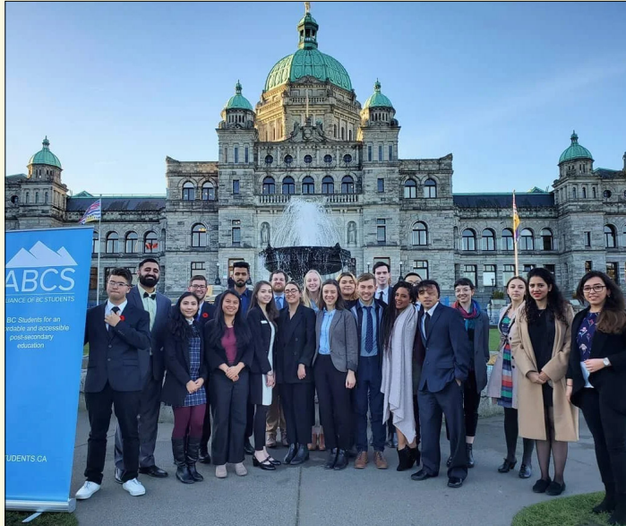
Student leaders from the Alliance of B.C. Students rallied before the holidays outside the legislature, in opposition to the post-secondary education currently being conducted.

if you need support. The canvass will be open until January 30th and once it has closed, the College will consider all responses but Management is not obligated to accept all of them – this process is intended to minimize workforce deductions. It is our understanding that the results of the canvass will be forthcoming