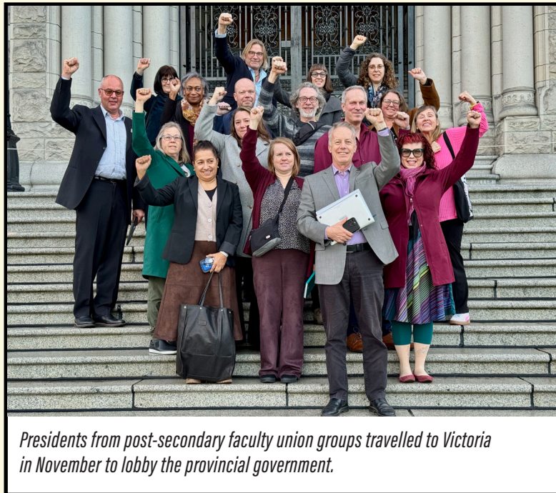
Presidents from post-secondary faculty union groups travelled to Victoria in November to lobby the provincial government.

Our colleges and universities are vital public assets, essential to both British Columbia's and Canada's innovation, workforce, and social fabric. That public infrastructure is currently under strain. Institutions are struggling to keep up with costs. So, in the short term, we need stabilization funding just to protect the capacity that is there.