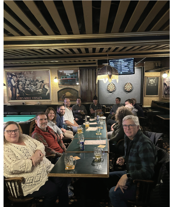
18 members gathered at Mike's Pub in Nelson on November 26th for the SCFA after work social.

https://www.kootenaycoopradio.com/kcr-releases-its-first-book/