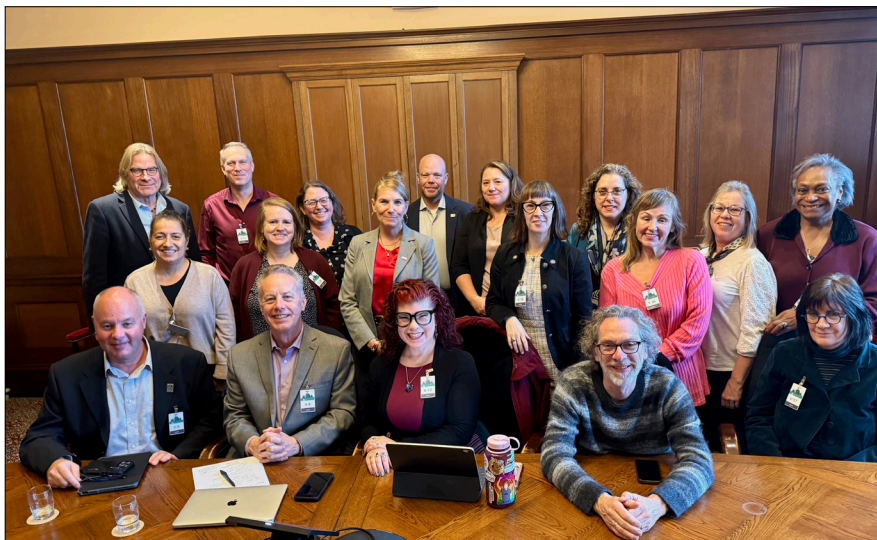
Over a two day period, faculty union presidents from across the province met with nine ministers to discuss the chronic underfunding of post-secondary education.